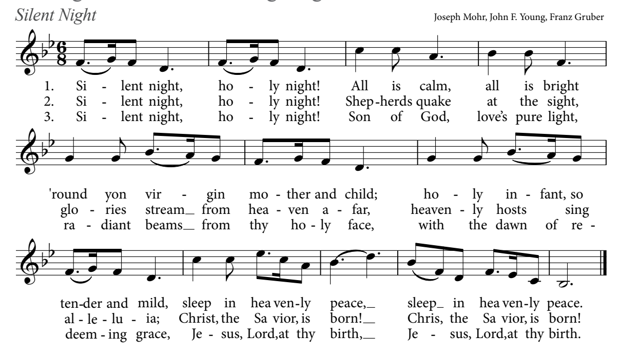
While singing the carol, candles are lit, beginning from the Christ candle.