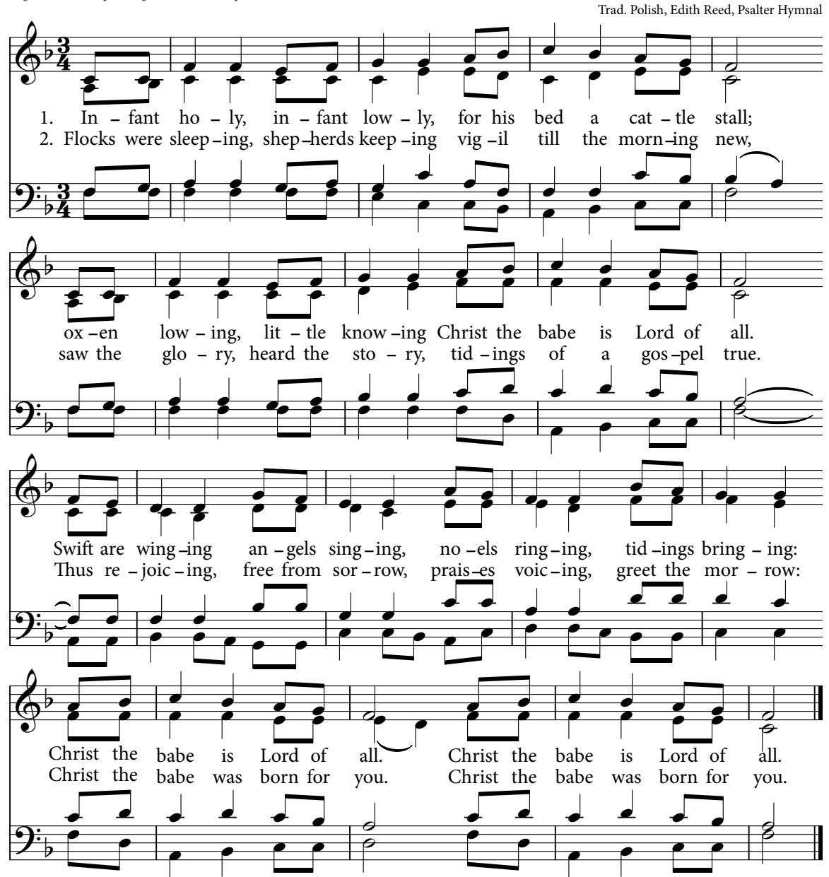
Infant Holy, Infant Lowly